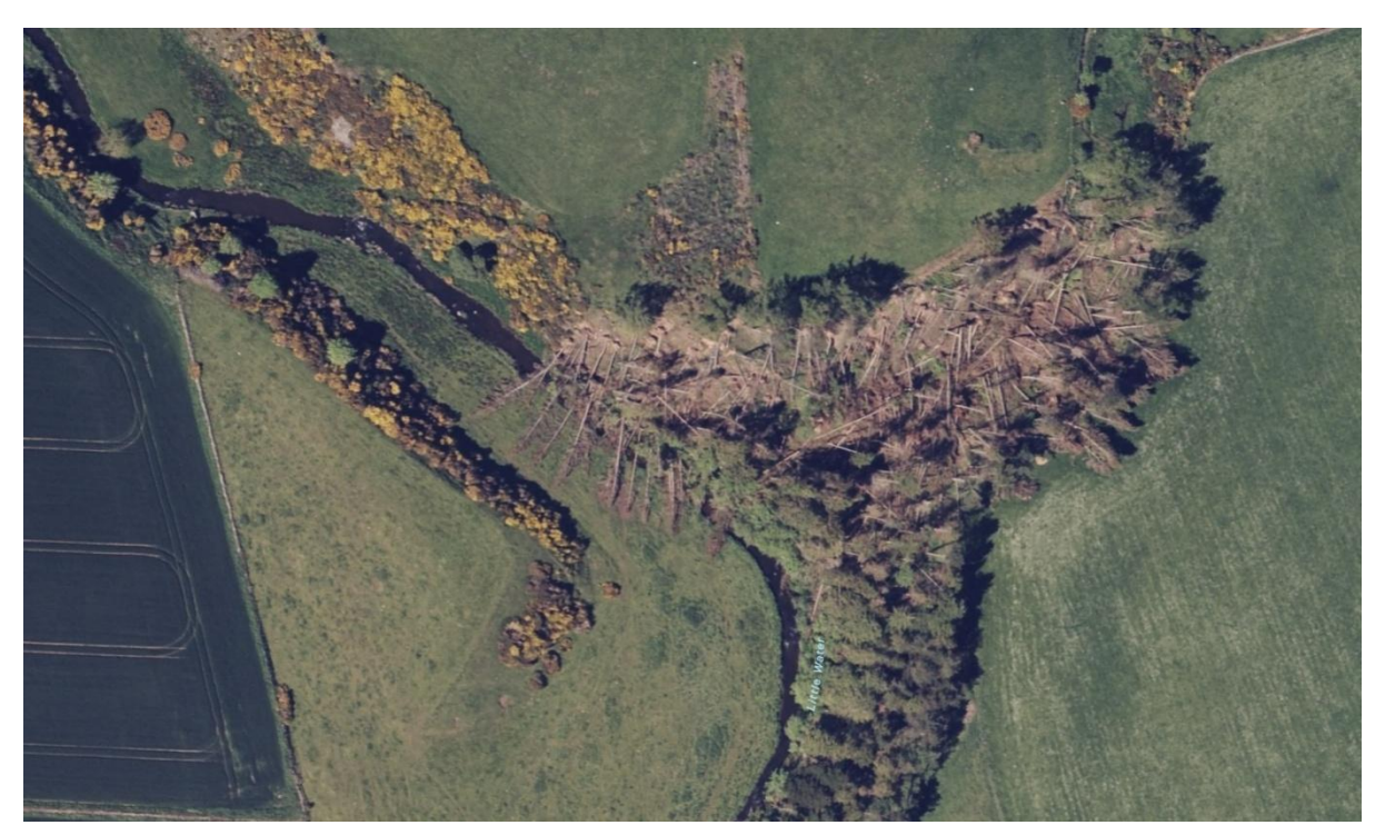
Figure 1. Aerial view of windblown trees for investigation on the Little Water.