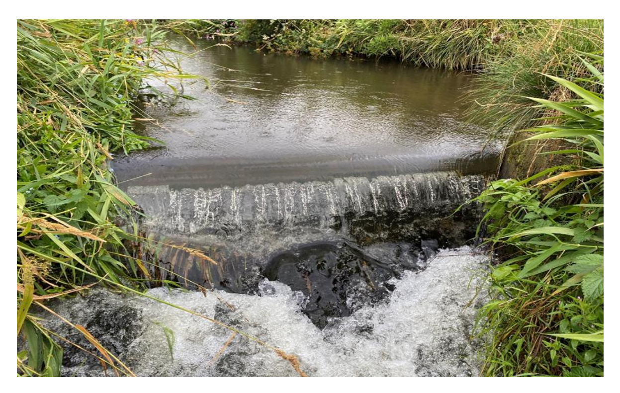
Fig 3. Below showing boards placed at the top of the Ebrie burn channel causing obstruction.

Approximately 900m further downstream is a spillway where water exits from the hydro scheme lade. This is a very steep decline with rocks at the bottom and wire mesh on the face. Salmon and sea trout smolts migrating downstream through the hydro scheme lade, have to exit over this spillway which could possibly cause serious injury, entrapment or death, figure 4.