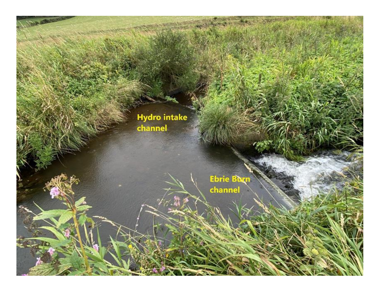
Figure 8. Denoted channels on the Ebrie burn at the Mill of Elrick water abstraction site.

We would request that there needs to be greater control placed upon the abstraction by the regulators, SEPA. The potential damage, loss and delay caused to smolts migrating downstream in either channel currently is not acceptable and likewise for the issues surrounding upstream passage of salmon and sea trout with reduced flows through a depleted reach of 900m. Given there is no economic activity associated with either structures (the hydro and fishery) this should result in action in a much quicker timeframe.