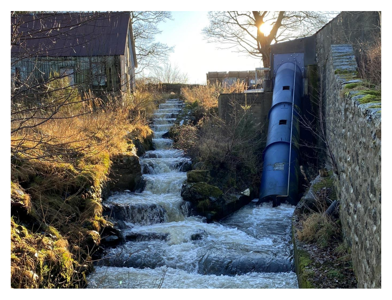
Figure 7. Lady Anna Falls step pool fish pass on left and hydro on right.