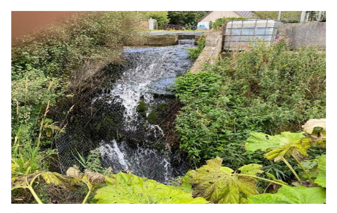
Fig 4, Spillway from hydro scheme.