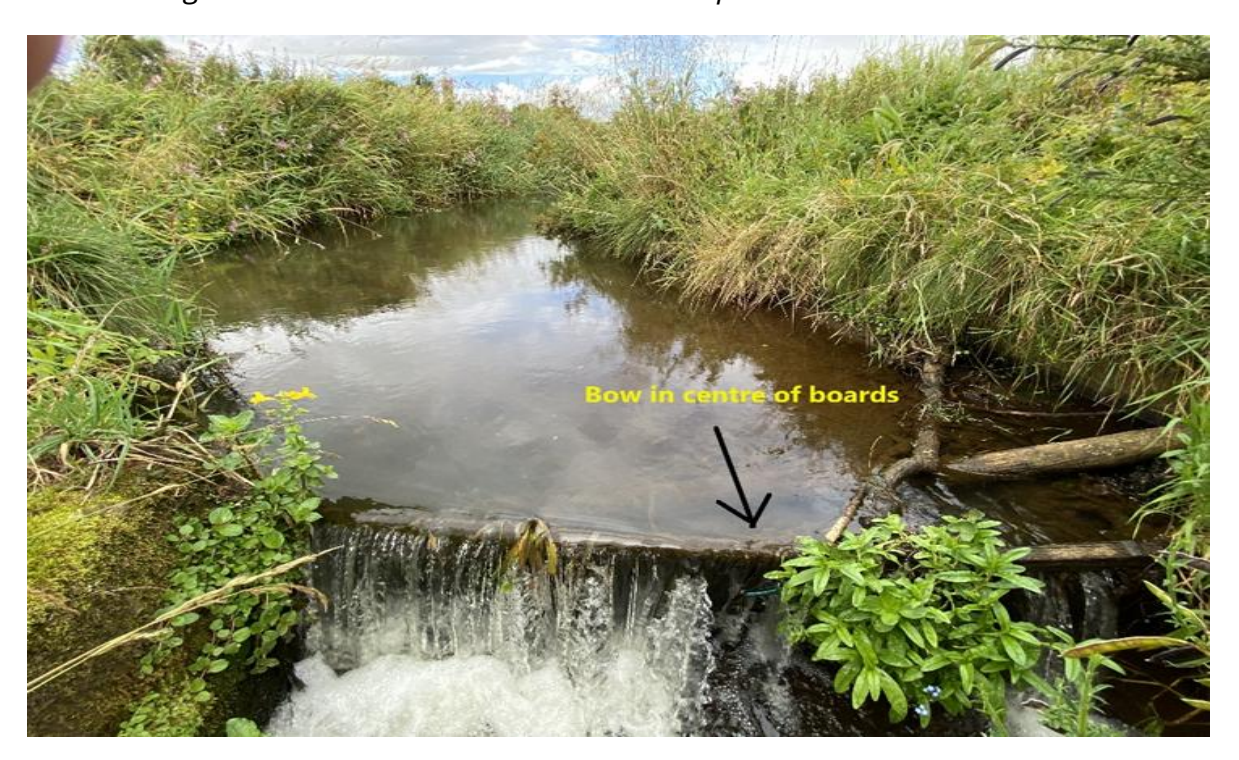
Fig 2, above showing bow in centre of boards at top of abstraction channel

Ebrie burn. This would be devastating for the fish and invertebrates in the depleted Ebrie Burn. See figures 2 & 3 below of the two boards in question.