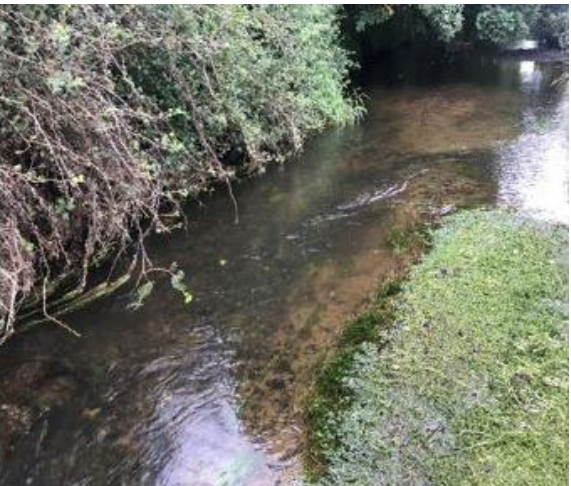
Figure 2 & 3. Before and After images of ranunculus removal.

A long-term solution could involve tree planting along the Ebrie Burn to provide shade and naturally reduce Ranunculus growth. Key planting locations identified through the habitat surveys carried out in 2023 could be utilised.