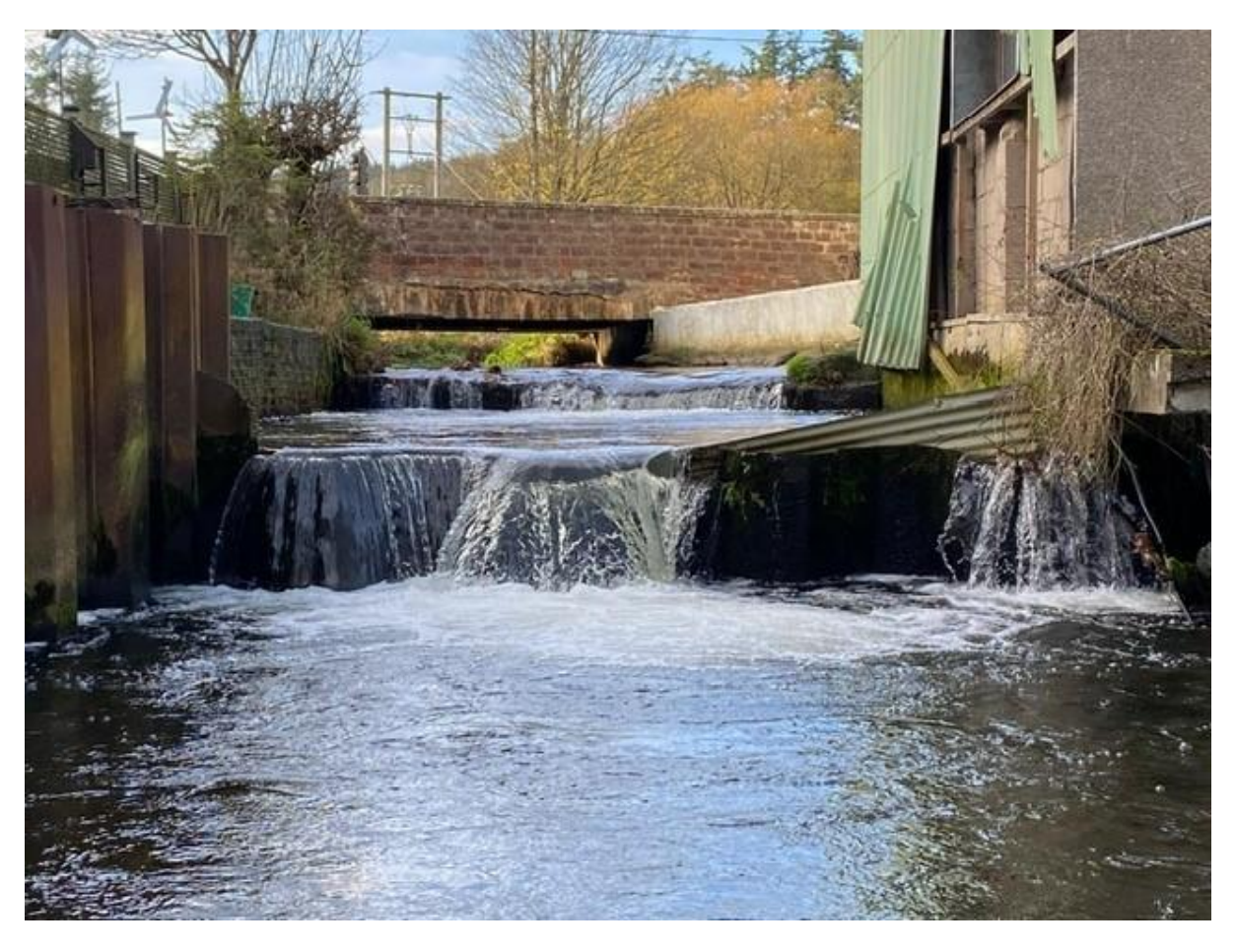
Figure 6. Two-stage sheet piling weir on the lower Fourdon burn by the village of Fyvie, owned by Scottish Water.

Resuming correspondence with Scottish Water would allow the Ythan DSFB to establish any timelines for interventions associated with this site.