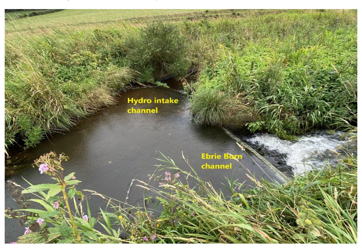
Fig 1. Denoted channels on the Ebrie burn at Mill of Elrick water abstraction site.

The right channel feeds the depleted section of the Ebrie burn, and the left channel feeds the abstraction intake, for the now defunct Mill of Elrick Fishery and Hydro Scheme. Figure 1 below showing the two channels in question.