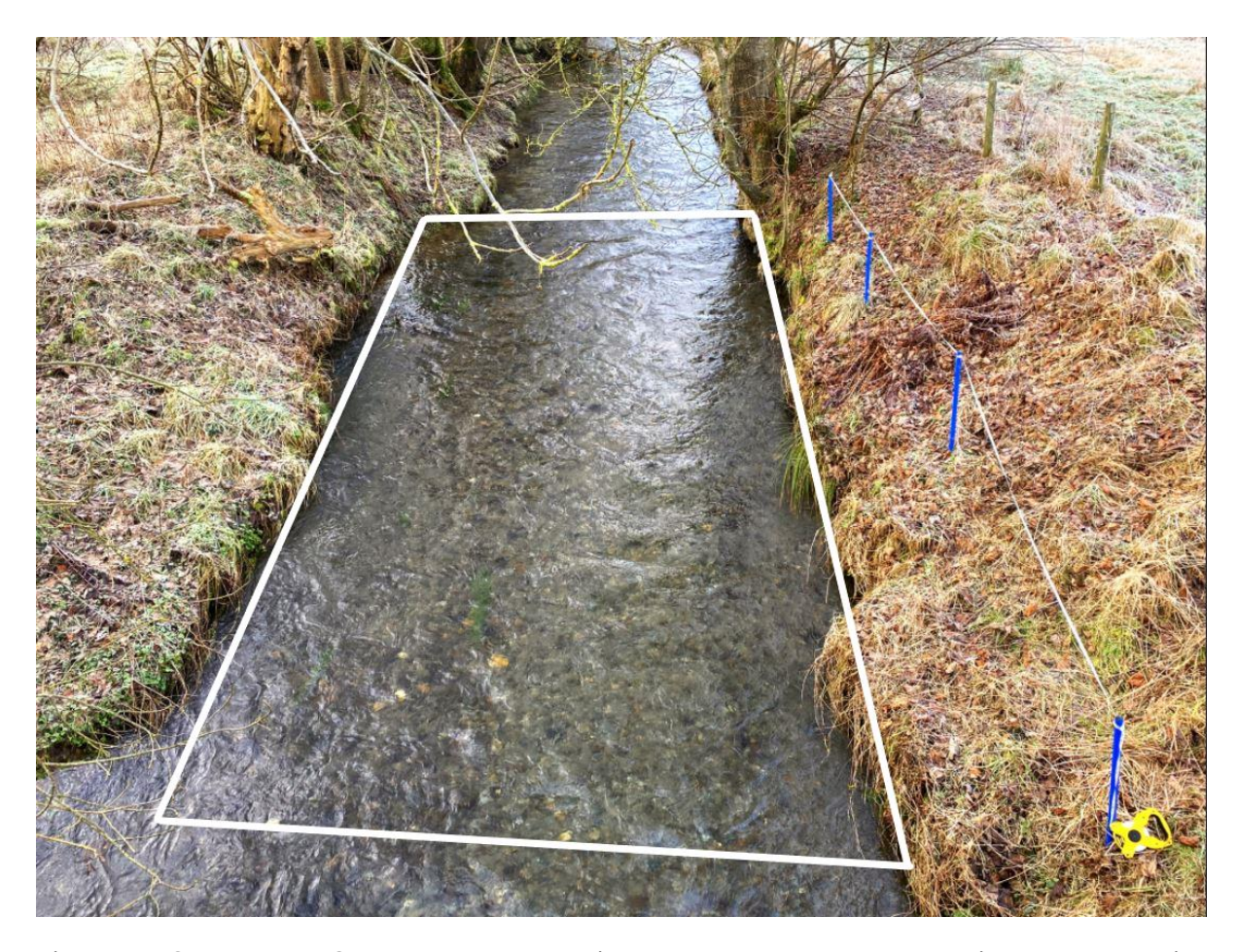
Figure 5. Chappel of Seggat, proposed site of compacted gravel delineated by white polygon.